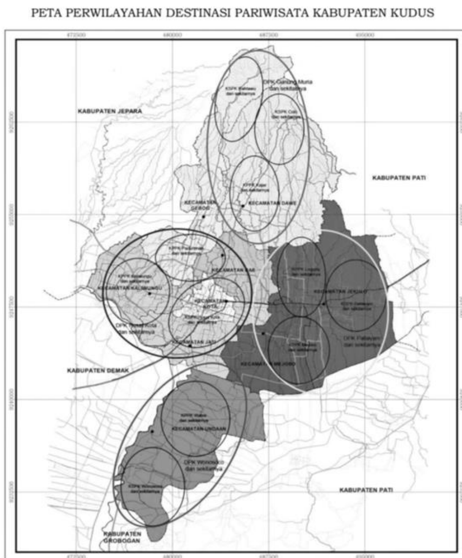
Figure 1. Map of the division of tourism areas in Kudus regency.

water tourism areas. The development of natural tourism and river and sea water tourism in Indonesia has become a special attraction for tourists from abroad and tourists from within the country, [15]. Some famous natural and water tourism destinations in Indonesia are Bali and Lombok. But apart from Bali and Lombok, Indonesia has good natural tourism, one of which is the natural tourism of the Muria Mountains. The Muria mountain area is located in three districts, namely Kudus district, Jepara district and Pati district. Of these 3 districts, the role of the Muria mountains is very central in maintaining air quality and the quality of clean water sources for local residents. Below is the Kudus Regency Tourism Map, including the Muria Mountains natural tourist area in Gebog District Rahtawu and Menawan Villages.