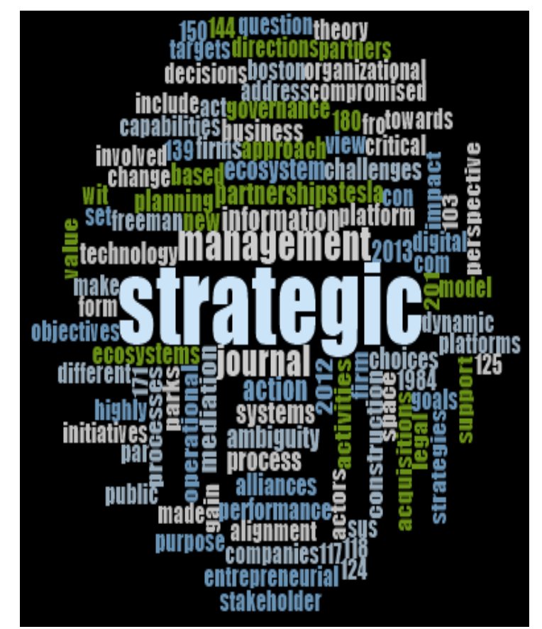
Figure 3. Words cloud strategic and thematic map.

The relevance of keywords in the primary theme can be assessed by examining their frequency of occurrence, which varies from more substantial to less substantial word lengths. The significance of essential terms within the core subject can be deduced through an analysis of their prevalence, beginning with longer words and progressing to shorter ones (Ivens et al., 2016; Lemmetyinen & Go, 2009).