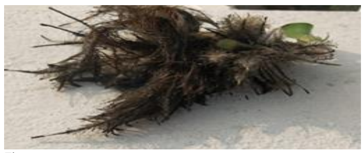
Figure 1. Root of water hyacinth plant.

Its spread started with its deliberate introduction into North America from Brazil, in the late nineteenth century, as an ornamental in ponds and subsequently escaped cultivation. At present it occurs as a weed throughout tropical and subtropical regions of the world. Water hyacinth is free floating aquatic plants in which roots play important role in removing nutrients [7]. It has tremendous capacity of absorbing nutrients and other substance from water [8] and hence brings the pollution load down. It is found to be most effective in removal of BOD, suspended solids, and heavy metals etc. from waste water [9]. The plant is extremely tolerant and has a high capacity for the uptake of heavy metals, including Cd, Cr, Co, Ni, Pb and Hg, which could make it suitable for the biocleaning of industrial wastewater. In addition to heavy metals, Water hyacinth can also remove other toxins, such as cyanide. It can remove arsenic from arsenic contaminated drinking water. It may be a useful tool for removal of toxic metals as it can soak up soluble heavy metal ions.