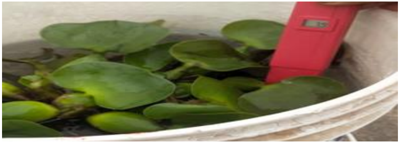
Figure 6. Measurement of pH with pH digital potable meter.