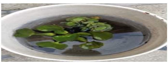
Figure 3. Water hyacinth growth is on 1st day.

Water Hyacinth is aquatic vascular plant with rounded, upright and shiny green leaves and lavender flowers. It is fast growing perennial with great reproduction potential. Growth of Water Hyacinth is primary dependent on ability of plant to use solar energy, nutrient composition of water, cultural methods and environmental factors. The effect of Water Hyacinth has resulted in significant decrease in turbidity and due to which the removal of flocs and reduction in organic matters in water have been observed. The primary purpose of this study is to make use of the water hyacinth plant for the purification of the tap water and hand pump water. The common water Hyacinth ( Eichhorniacrassipes ) is vigorous growers known to double its population in only 12 to 15 days. Optimal water pH for growth of this aquatic plant is neutral but it can tolerate pH values from 5 to 10. This is very important fact because it points that water hyacinth can be used for treatment of three types of contaminated water.