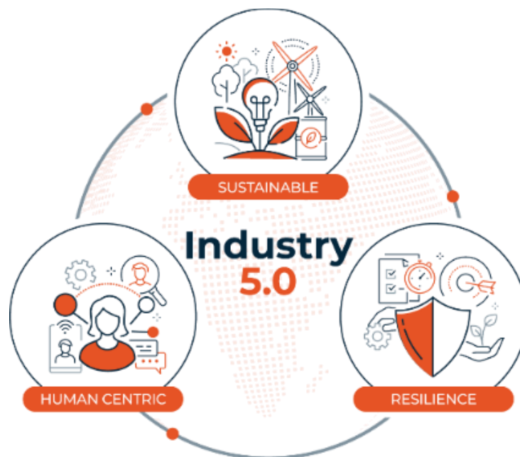
Figure 1. The pillars of IR 5.0 [6].

After the initial hype following the launch of the new technologies dissipated, it became increasingly clear that technology-focused terminology without objectives did not provide the correct orientation to related policies. Recognizing this, the European Commission began promoting the Industry 5.0 concept in 2020. As Figure 1 illustrates, IR 5.0 utilizes a three-pronged focus on human-centricity, sustainability, and resilience. It places this at the heart of IR 5.0 technologies and processes to allow industry to serve humanity with a long-term vision considering planetary limits [5].