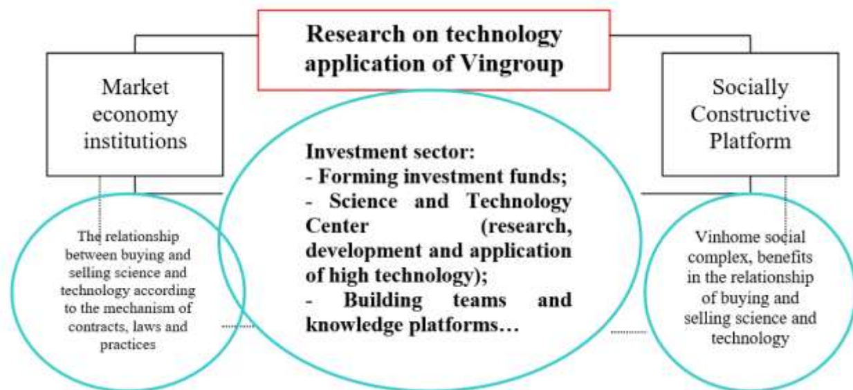
Figure 2. Technology application model of Vingroup corporation.

(1) The role of the state is very important in assigning land ownership to Vingruop Group (230 thousand m 2 Rayol City, 360 thousand m 2 Time City, 2,800 thousand m 2 Smart City... in Hanoi; 7,850 thousand m 2 Imperia Hai Phong; 14,750 thousand m 2 Star City Thanh Hoa; 2,710 thousand m 2 East of Ho Chi Minh City...); encouraging the establishment of scientific research and technology application funds from various sources (from business accumulation, from business linkages, from residential communities...) to form large enterprises with influence and national brands (such as the VinFast automobile brand); forming and building centers for research, development and application of high technology in agricultural production (such as the VinMart brand), automobile manufacturing industry (VinFast brand),...; Creating a real estate market, converting land use rights and valuing land assets according to regulations (such as buying ownership of apartment buildings, exploiting urban space, contributing brand capital in business partnerships, etc.); orienting, planning and supporting the application of smart technology, urban beautification towards modernity and sustainable development (such as Smart security, smart cities, smart apartments, smart communities, etc.)