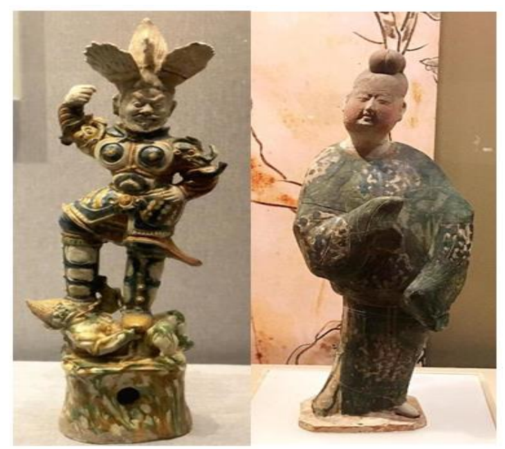
Figure 2. On the left is a white-bodied Tang Sancai Heavenly King figurine, and on the right is a red-bodied lady figurine. Source: Liu Fei (August 2022, July 2017).

However, some nobles were buried in Chang'an, the Western Capital. After their death, the white body Sancai was likely sent from Luoyang to Chang'an and then buried with the deceased. The white-body figures in the tombs of Li Hui and Kang Wentong provide archaeological evidence for this speculation. Between 705 and 755, there were two Sancai production centers: one near Chang'an (now Xi'an), mainly producing red-body products, and the other near Luoyang, producing white-body products (Figure 2).