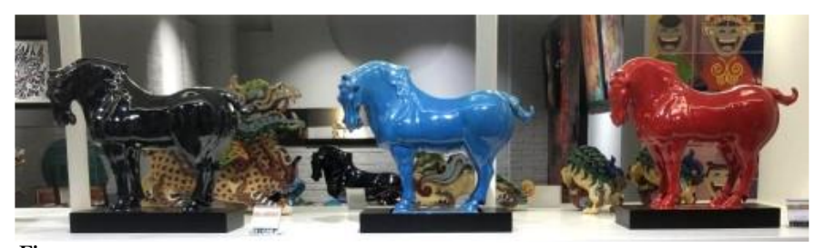
Figure 3. Three-color horse craft ornaments.

Tang Dynasty tri-color pottery figurines from the Luoyang area have seen more innovative forms in today's market. Modern Tang tri-color works retain the essence of traditional techniques while incorporating contemporary design elements (Figure 3). Such works use different color combinations and glaze techniques to cater to modern aesthetics. They are often brighter and may use additional materials to create unique textures and effects.