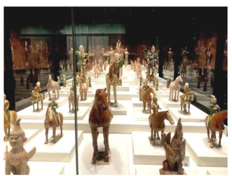
Figure 1. Exhibits of the grand canal cultural museum of the sui and tang dynasties.

Edelweiss Applied Science and Technology ISSN: 2576-8484 Vol. 8, No. 6: 6644-6662, 2024 DOI: 10.55214/25768484.v8i6.3416 © 2024 by the author; licensee Learning Gate