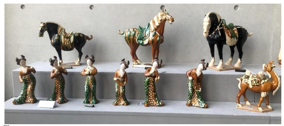
Figure 4. Ladies' figurines and tri-colored horses and camels. Source: Liu Fei (February 2023).

To adapt to the modern market, some craft practitioners began mass-producing low-cost, low-quality Tang Sancai pottery figurines on assembly lines. These works are mainly for the tourist market and may not strictly follow traditional methods. They are usually more affordable and use cheaper materials. The color and shape of such works may not be as accurate as tradition replicas, and the overall craftsmanship is relatively simple. This behavior not only damages the cultural value of Tang Sancai pottery figurines but also has a great impact on the inheritance of their artistry and craftsmanship.