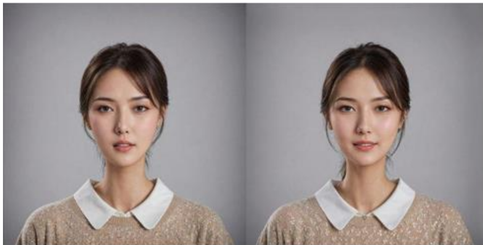
Figure 1. Rigidity of Expression [14].

As one of the leading AI image generation models, Stable Diffusion has been widely applied to various image generation tasks. However, testing has revealed significant deficiencies when directly utilizing the Image-to-Image mode to generate human faces. As shown in Figure 1 [14] the facial expressions in the generated images often have insufficient range or are uncontrollable, to simulate the rich spectrum of human facial expressions authentically. These issues render AI-generated facial images produced in this manner inadequate for meeting the high-quality requirements necessary for Deepfake training.