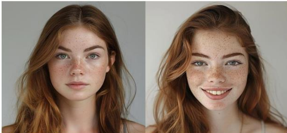
Figure 3. Creating Faces by Adding Commands [14].

To address this issue, a plugin called InsightFaceSwap presents a more effective alternative. Users only need to add the InsightFaceSwap bot to their server to input a source face, save it as a Face ID, and proceed with face swapping. Leveraging advanced algorithms, the InsightFaceSwap plugin demonstrates excellent performance in terms of both uniformity and stability, significantly enhancing the consistency and reliability of generated images.