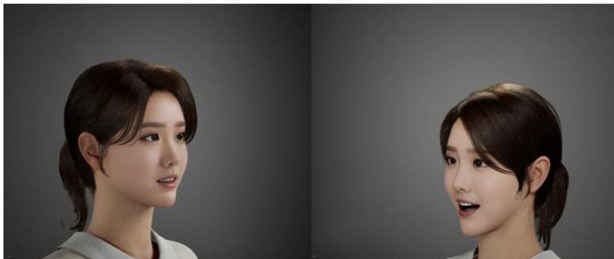
Figure 4. Creating Faces with InsightFaceSwap

The integration of Midjourney with Deepfake technology offers several advantages. The high degree of control over facial features and expressions provided by Midjourney's command parameters allows for creating diverse yet consistent training datasets. This is particularly valuable for Deepfake models, as it enables the generation of a wide range of facial expressions and angles while maintaining the core identity of the subject. As shown in Figure 4, the InsightFaceSwap plugin further enhances this capability by ensuring high consistency across multiple generated images, which is essential for training robust Deepfake models.