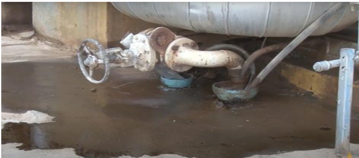
Figure 3. Pipeline Spills.

3- One gram of a particle size of the clay, fine sand, and silt fraction less than 75 \mu\text{m} , in which trace elements are concentrated, was taken for the purpose of conducting a trace element test.