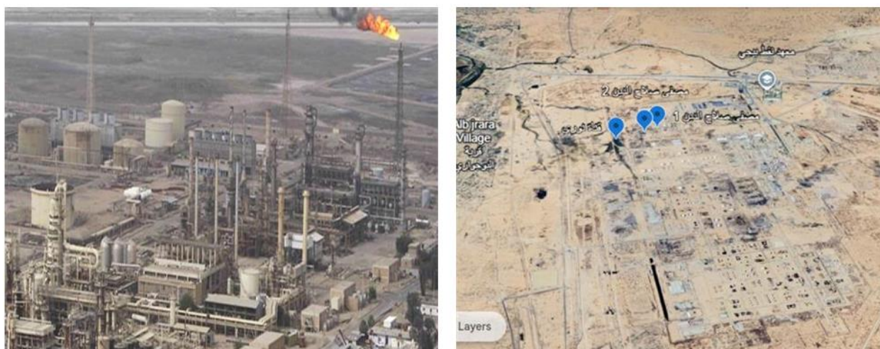
Figure 2. Baiji Refinery.

Lead, mercury, cadmium, zinc, and copper are examples of heavy metals that can accumulate in the surface soil as a result of various factors such as mining industries, solid waste, and air pollution.