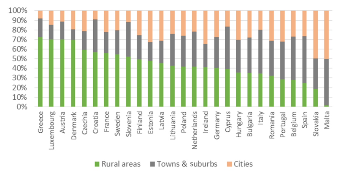
Figure 1. Tourism distribution per EU country, 2021.

place in rural areas as of 2021 compared to 33.8% in towns and suburban areas and 22.4% in urban areas. The allocation of tourist accommodation shares per these categories by European country is displayed in Figure 1 developed by the authors based on statistical data published by Eurostat [3].