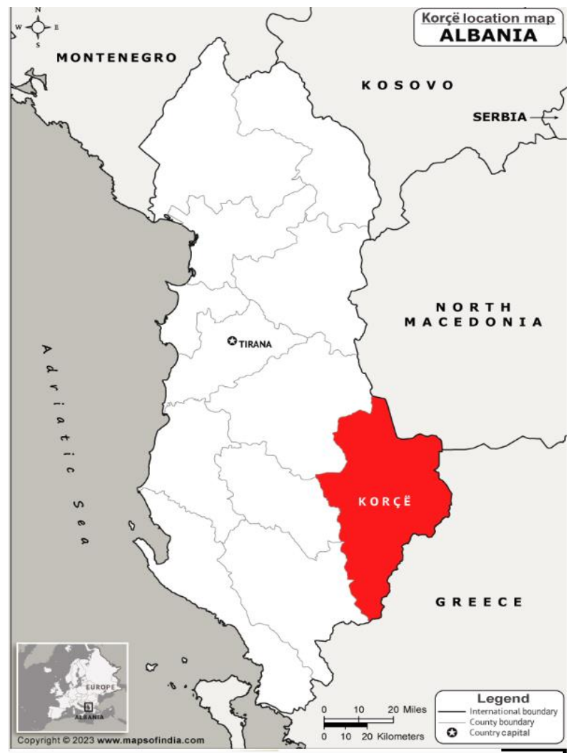
Figure 3. Korça region. location of the study area.

the potentials of rural tourism, it is important to understand the perceptions of the local communities in regards to the potential of rural tourism development and to determine the factors that motivate the local community to develop rural tourism.