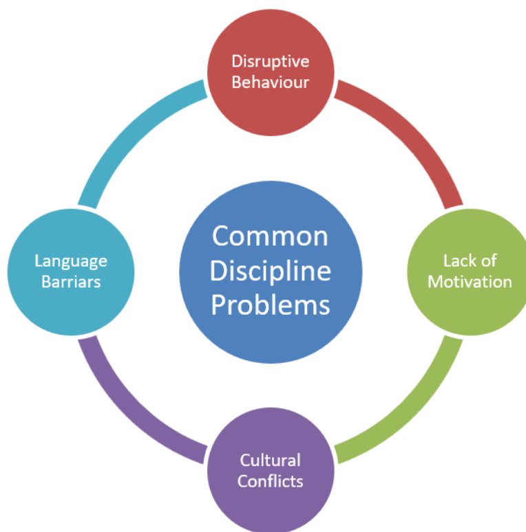
Figure 1. Summarizes the common discipline problems in ESL/EFL Classrooms.

In ESL/EFL classrooms, teachers encounter numerous discipline issues that can disrupt the flow of their lessons and compromise the learning outcomes. These problems are not unique to language classrooms but rather stem from the conditions that come with teaching a foreign language. The ESL/EFL teacher encounters several common types of discipline problems illustrated in Figure 1: